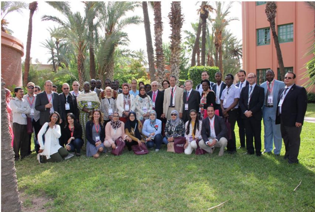
Photo 5: Group photo of participants in this first African edition of the congress

The event closed on 08/04/2017 with a gala dinner and a collective photo of the participants.