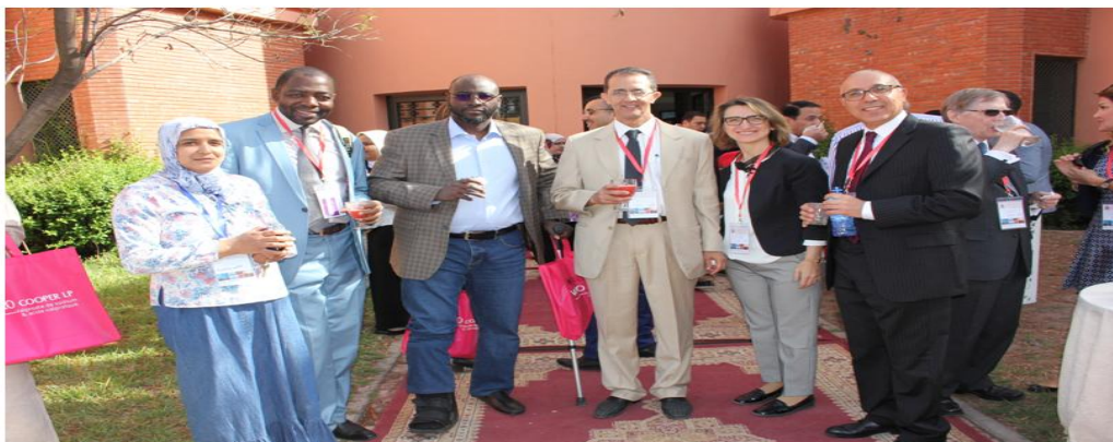
Photo 3: Neurologists from Morocco, Turkey, Mali and Cameroon, during the 1 st day morning coffee-break. Africa was in the spotlight.

scientific committee consisted of imminent neurologists from Morocco, Africa and Turkey: At least 223 participants from 18 countries were present, from both French and English-speaking regions.