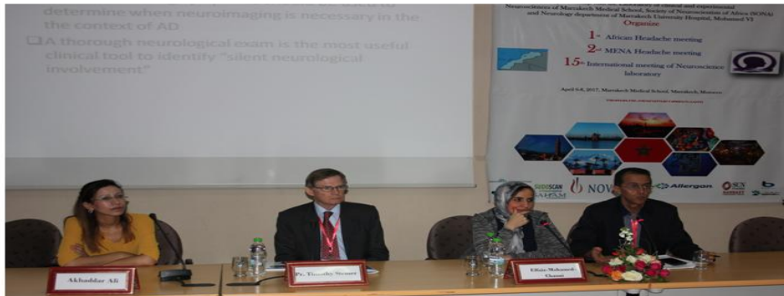
Figure 2: photo from 1 st session: dedicated to epidemiology, chaired by Pr. Timothy Steinert, Pr. Naiib Kissani and Pr lamiaa Essaadouni.

During this congress, the scientific program was rich, divided between a scientific section reconciling interventions of the world experts in headaches to practical workshops, oral and poster presentations.