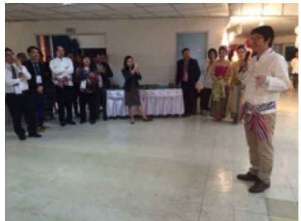
Learning traditional Thai dancing and cuisine.