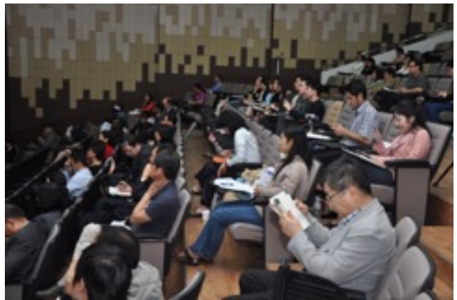
During the meeting