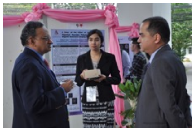
During the poster presentation and poster tour