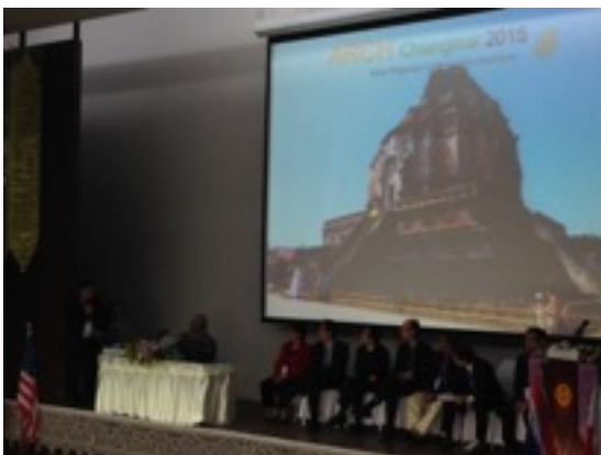
Panel discussion on the session "For better headache care in ASIA"